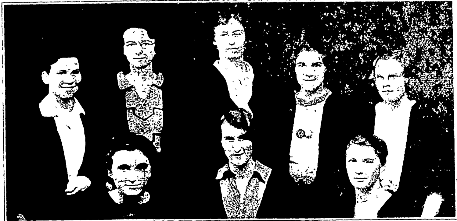
CLARK HALL ATHLETIC ASSOCIATION EXECUTIVE